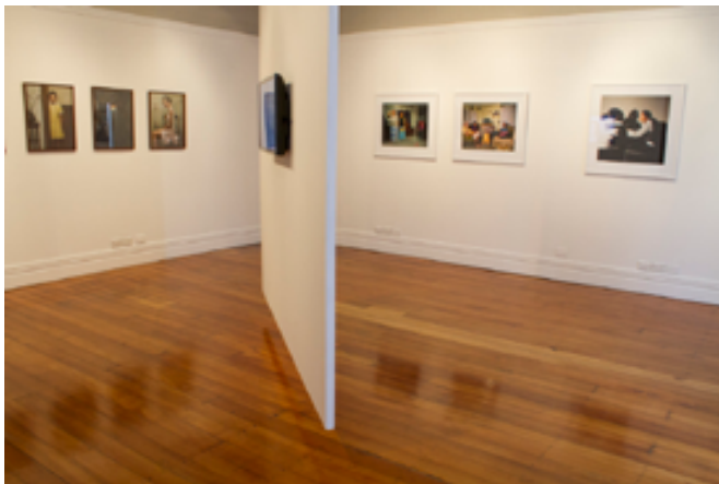
Enjoy Public Art Gallery, 28 August – 21 September, 2013